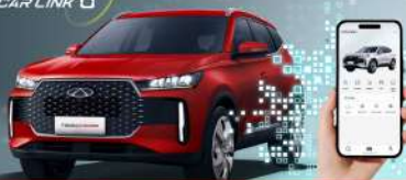
Car Link O (IOV)