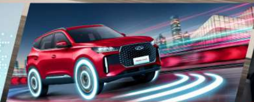
15 ADAS (with LKA)