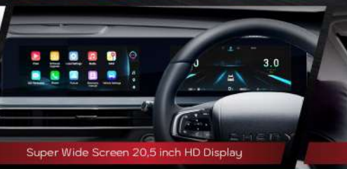
Super Wide Screen 20,5 inch HD Display