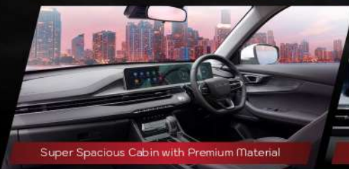
Super Spacious Cabin with Premium Material